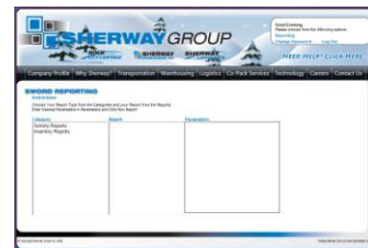
Figure 3 – Sword Reports