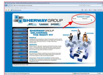
Figure 1 - Login Box