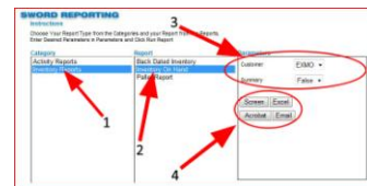
Figure 4 – Report Selection